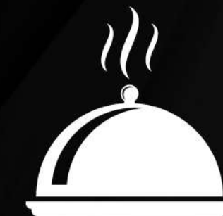
Food & FMCG